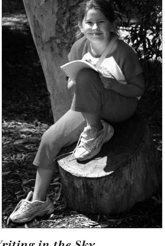
Writing in the Sky By Michela Rodriguez, 3rd Grade

Flashing colors dancing lights, Diverse people like 'on the town' nights High notes low notes in between Some notes really upset me Smoother than chocolate Softer than silk subtly swell Like mother cow's milk Hotter than heat cooler than ice Temperatures in between and Everything nice Sharp as cheese bland As toast sweeter than sugar Salty spray from the coast Delicate as roses harsh as Fire smells like anything Your heart desires.